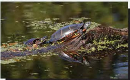
Eastern Painted Turtle